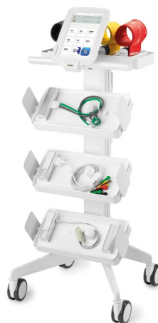
MESI mTABLET Trolley