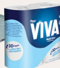
10013327 KLX VIVA CLEANING TOWEL $31.80