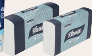
10013331 KLX OPTIMUM TOWEL $95.19