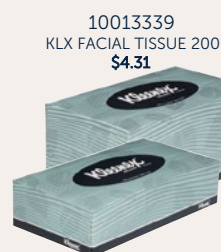
10013339 KLX FACIAL TISSUE 200 $4.31

*97% of facial tissue, 79.0% of towel and 66.9% of our bath tissue volumes are produced in SA (2022)