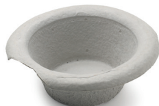
111AA200 Medium Bowl