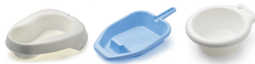
Plastic Assorted Pan Supports