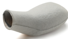
102AA100 Male Urinal Traditional