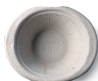
104AA200 General Purpose/Vomit Bowl