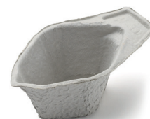
116AA200 Multi Cup