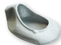
108AA032 Vernafem Urinal