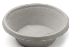
112AA100 Large Bowl