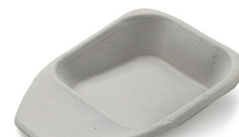
114AA100 Maxi Slipper Pan