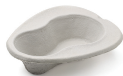
101AA100 Bedpan Liners 100s