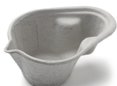
110AA100 Measuring Jug