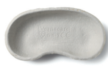
105AA260 Kidney Dish