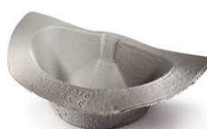
113BA100 Mid Stream Samper