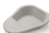
109AA100 Midi Slipper Pan