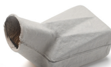
103AA120 Male Urine Bottle